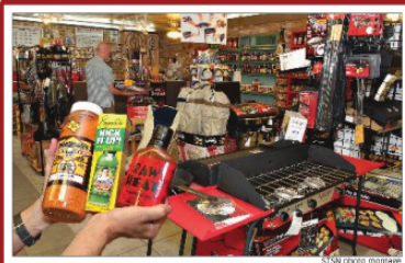
ALL THINGS BBQ: If it's too hot to barbecue, now is a great time to barbecue. To keep these grills going, Brookler's Propane on Arizona Avenue in Chandler is celebrating their 10th anniversary by continuing to dispense propane and wood. Now Brookler's has a great selection of grills and accessories, too, including saucers, marinades, hand tools, utensils and spare grill parts. Brookler's Propane is located at 19030 E. McDowell Ave. south of the SanTan Loop 202 Freeway and Germann. Call 480-782-6848 or visit www.brookerspropane.com for details.

July 4 - 17, 2009 www.SanTanSun.com Relentlessly local coverage of Southern Chandler and our neighboring communities